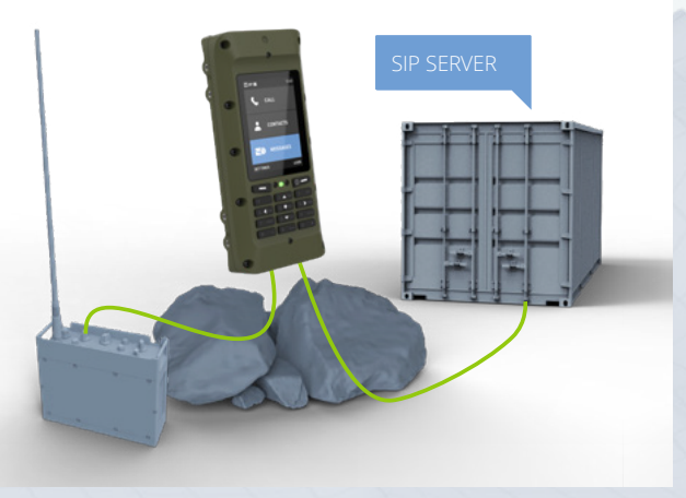
SHDSL network access point